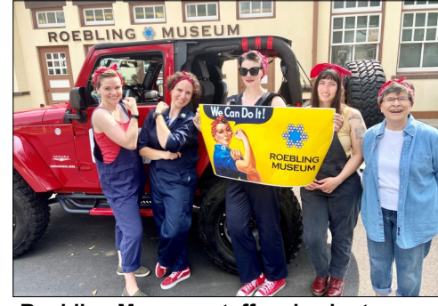
Roebling Museum staff and volunteers prepare for the Florence Township Patriotic Day Parade held on July 8