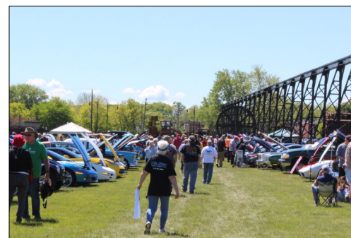
Over 150 cars participated in the Thirteenth Annual Roebing Museum Car Show held on May 6