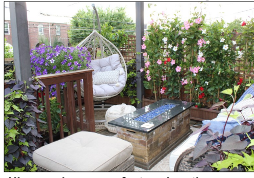
Nine gardens were featured on the Roebling Museum Garden Tour held on June 10