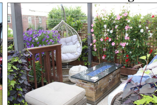
Nine gardens were featured on the Roebing Museum Garden Tour held on June 10