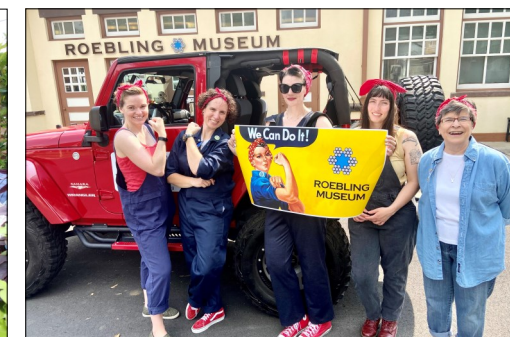
Roebing Museum staff and volunteers prepare for the Florence Township Patriotic Day Parade held on July 8