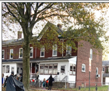
Left: c1905 Right: 2020

Roebling Museum is preserving an example of worker housing in our company town! When the property directly across from the museum went on sale, we took quick action to raise money for a down payment. To be successful, we need you to participate in creating a vision for the future of 101 Second Ave. Get in touch and visit roebblingmuseum.org/historyhouse to share feedback, stay in the loop, or get involved.