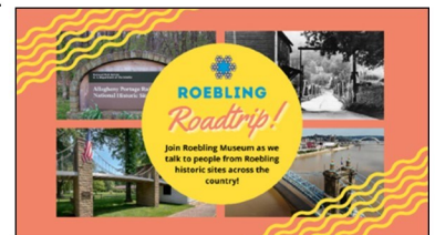
Virtual Lectures with folks from Roebing-related historic sites around the country

As you know, Roebing Museum has been closed since March due to the pandemic and during this time the museum has quickly adapted to create brand new, relevant, and safe opportunities to give back to our supporters. Pay-what-you-wish programs have kept our gates open and I hope you’ve been able to take part in our community-led walking tours, yoga classes, the pop-up open house, and outdoor art programming, or our online offerings including yoga and the Roebing Roadtrip virtual lectures. Let us know if you have ideas for tours and online programs for the spring!