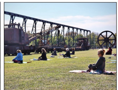
In person yoga classes at the museum as well as virtual yoga