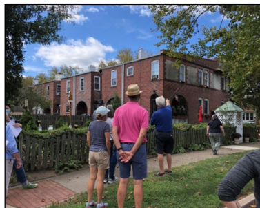
Town talk and tours led by community historians