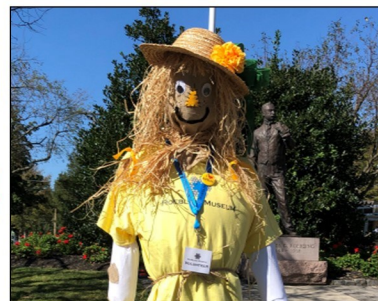
Scarecrow contest, October 2020