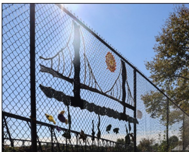
Community Art fence installations